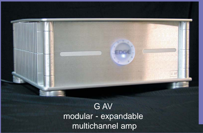
G AV modular - expandable multichannel amp